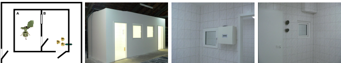
Figure 1. Pollen chamber at the Allergie-Centrum-Charité. Room "A" represents an interior room, e.g. a living room, room "B" represents pollen-containing open air. Pollen are released in chamber B at 0h, 2h, and 4h to provide a steady state level of pollen circulating in the chamber. The pollen protective grid (poll-tex®, provided by L. von Heek Textiles) is attached to the open window, and high concentrations of different pollen are released in the "outside" room. The amount of pollen entering room A are then assessed using a volumetric Burkard pollen and spore trap.

Allergic diseases such as allergic rhinoconjunctivitis or allergic asthma are global health problems which have significant impact on patient quality of life, health-care costs, and economic productivity. In allergic patients who have been sensitized to a certain allergen, mast cells are activated after contact with the respective allergen by cross-linking of antigen-specific IgE bound to the high affinity IgE receptor FcεR1. The activation of mast cells then results in the release of a plethora of mediators, among them histamine and leukotrienes, i.e. products responsible for allergic symptoms. To prevent allergic symptoms, different approaches can be chosen alone or in combination: 1) pharmacological inhibition of mast cell mediators (e.g. receptor antagonists of histamine and leukotrienes), 2) pharmacological abrogation of mast cell activation, 3) Reduction of circulating allergen-specific IgE, and 4) Avoidance of the eliciting allergen. Obviously, the avoidance of allergens is the optimal method for the prevention of allergic symptoms; however, certain disadvantages make it difficult to achieve efficient allergen control. Here, we tested whether a light- and air-transmissive the novel textile material poll-tex® can prevent the inflow of pollen in a standardized pollen chamber.